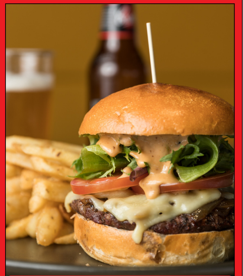
DINNER + DRINK